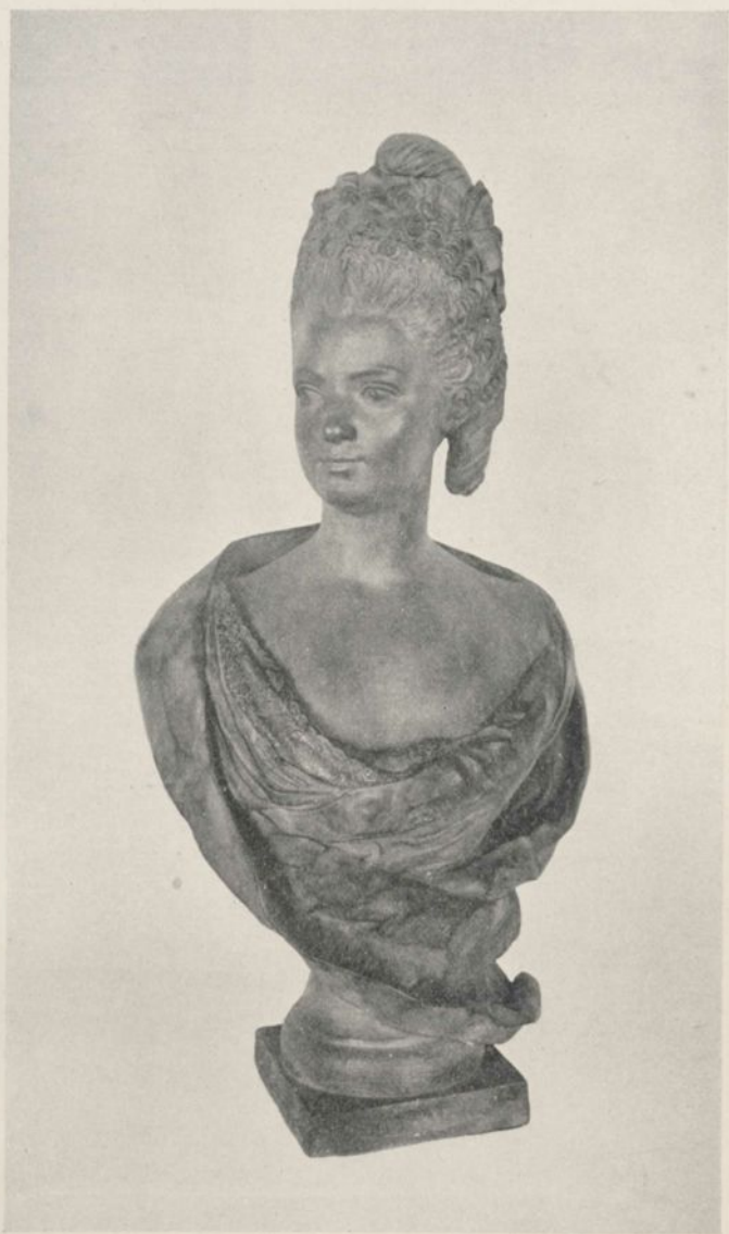
No. 154. TERRA COTTA BUST